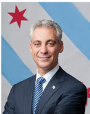
RAHM EMANUEL MAYOR