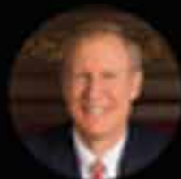
Governor Bruce Rauner State of Illinois